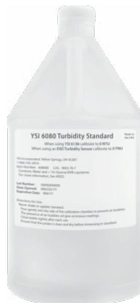
If not using formazin-based standards, YSI branded AMCO-AEPA standards must be used when calibrating YSI turbidity sensors.

YSI, a Xylem brand 1725 Brannum Lane Yellow Springs, OH 45387