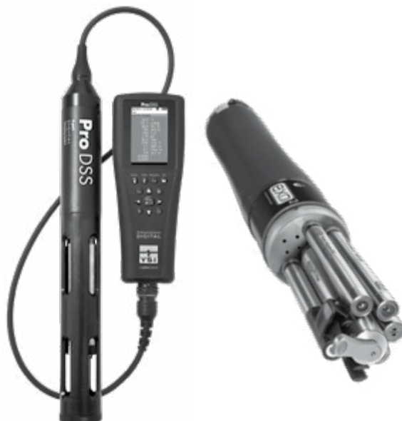
The YSI ProDSS is an ideal instrument for environmental spot-sampling, while the YSI EXO sonde platform is perfect for continuous environmental monitoring.

Using DI or distilled water for calibration and then taking measurements in waters containing low turbidity may exhibit slightly negative readings since the water that is being measured may actually contain less turbidity than the zero standard that was used during calibration. For these applications, it is typically necessary to use a certified zero standard for calibration.